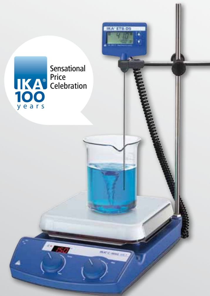
C-MAG HS 7 IKAMAG® Package