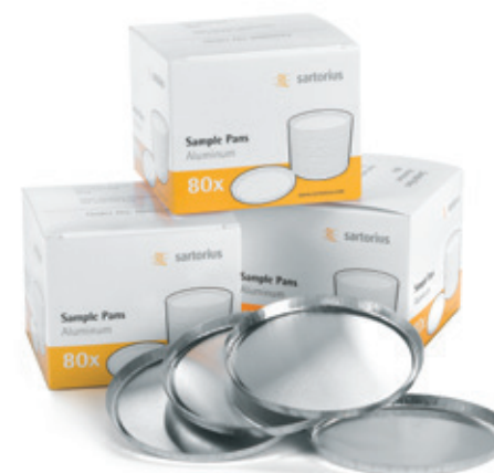
Disposable sample pans